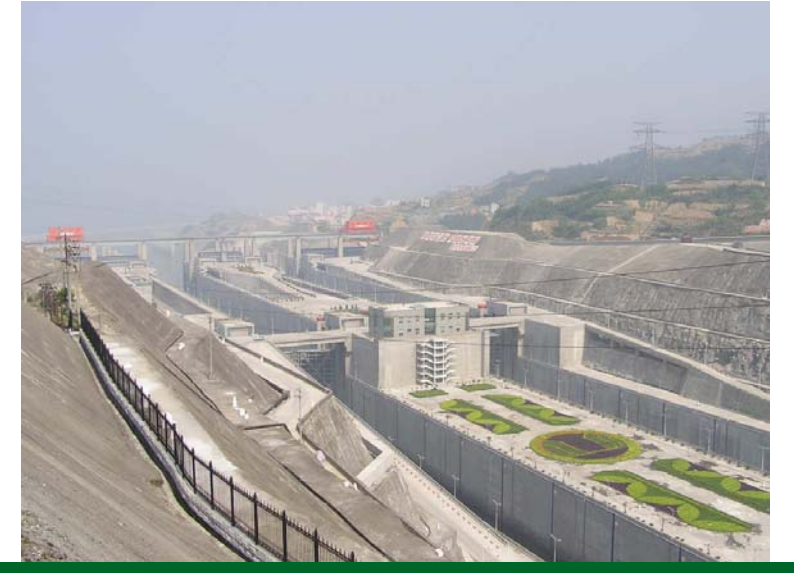
Tourist's View of Three Gorge's Dam

technologies between Rockwell Automation and ProSoft Technology has enabled SCADA systems around the world to gather data and control operations in a multitude of plants just like the Shanghai Wastewater Plant and the Taihe Water Factory.