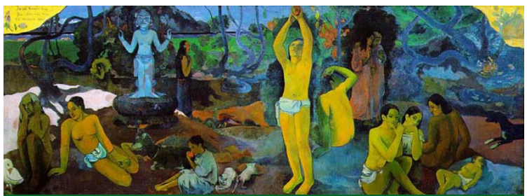
Where Do We Come From? What Are We? Where Are We Going? Paul Gauguin, 1897–98

If you happen to be at ISA EXPO 2006 October 17-19, stop by and wish us Happy Birthday!