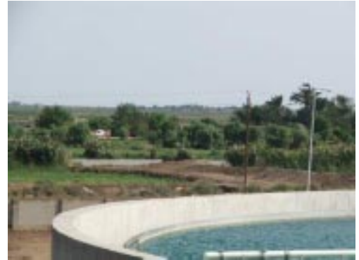
The Garaaf River lies east of the Flocculation Clarifier.

Individual ControlLogix processors were placed at three pump stations