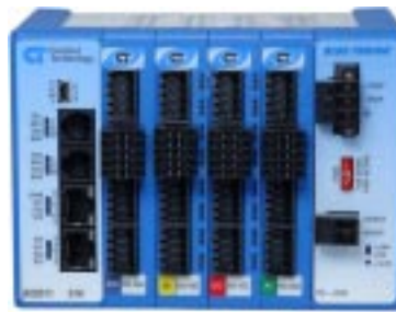
BlueFusion™ Model 5300

Blue Fusion controllers support the Modbus protocol on the serial and Ethernet ports. Designers can use Modbus to connect Blue Fusion to thousands of third party devices and computer systems. The device supports Master/Slave TCP and RTU, Master/Slave Serial RTU/ASCII. The Model 5300 can also be used as a converter to translate between different Modbus formats.